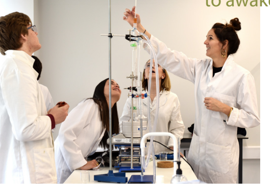
Learning in two languages from age 3: students may choose from two study paths from Y7 to Y13.